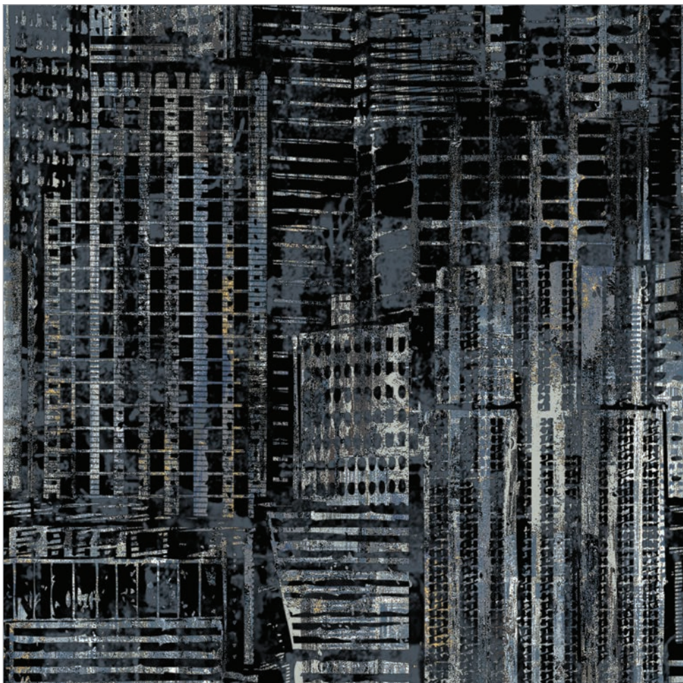
23957-99 | City Scene | Black Multi