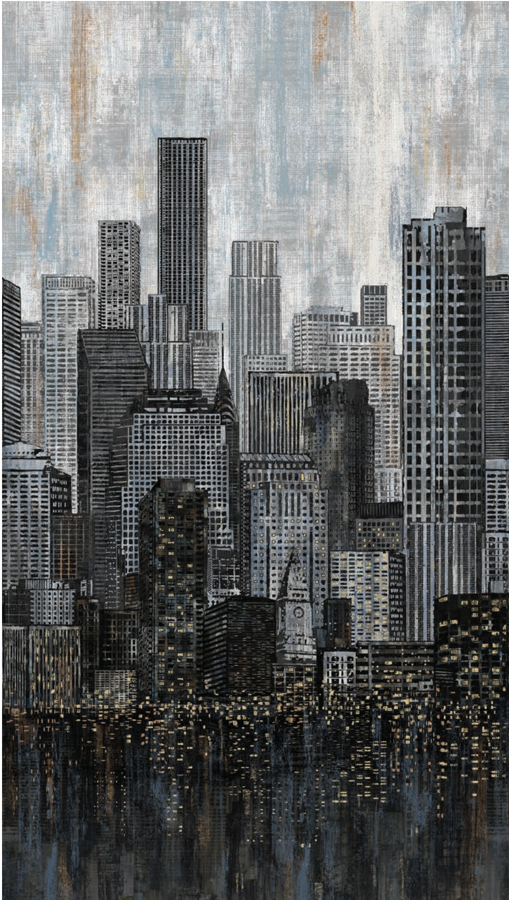
23956-99 | City Light Full Width Border | Black Multi