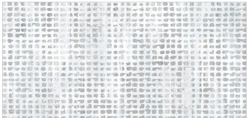
23961-91 | Mini Squares | Light Gray